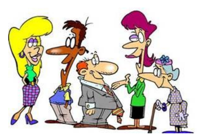
COME AND ENJOY!

Ending with the ever popular ' Fireworks on the Dyke ' at dusk. Music and various venues will also be present in the wharf area prior to the fireworks.